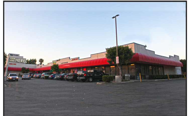
Exterior Shot 2