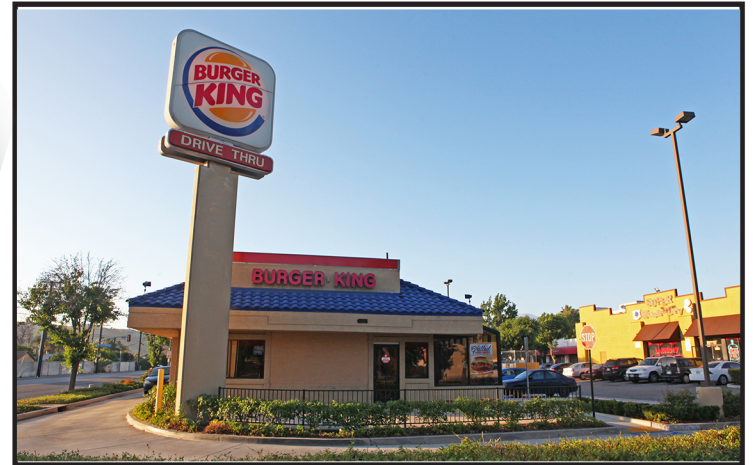
Exterior Shot 1